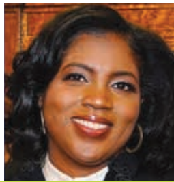
Judge Timika Lane for Superior Court Recommended by the PA Bar Association