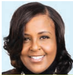
Judge Lori Dumas for Commonwealth Court Recommended by the PA Bar Association